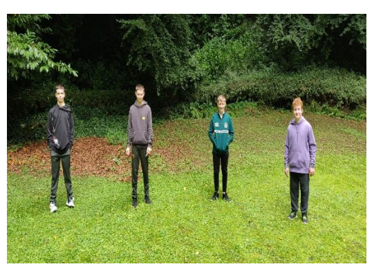
Up and walking!