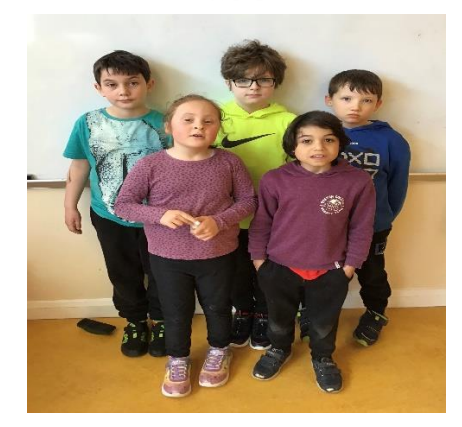
Ready for learning!