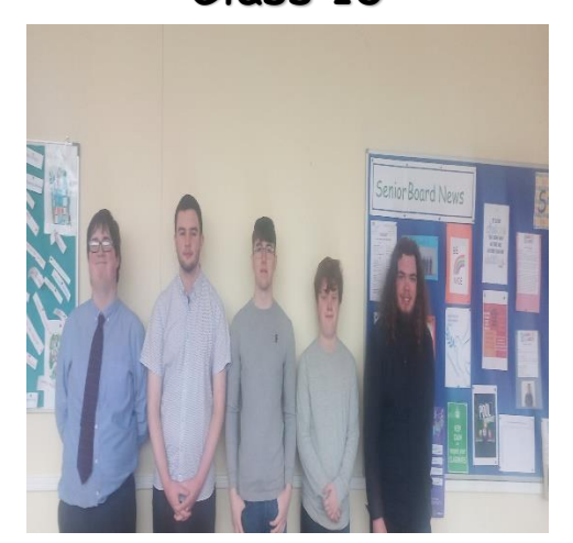
LCA interview day!