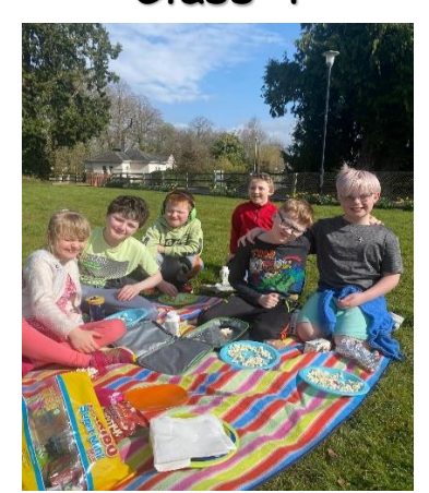
Picnic in the park!