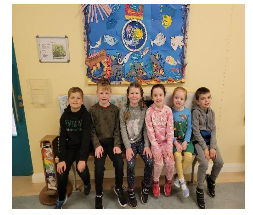
Admiring our class art!