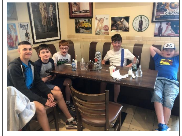
Meals out together!