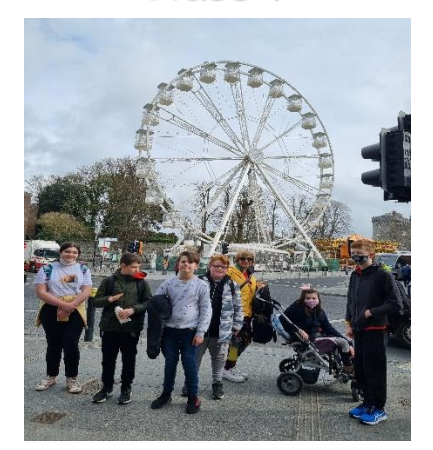
Summer Class Trip!