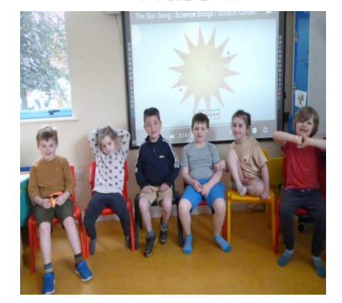
Spending time together!